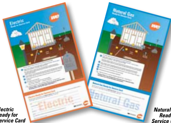
Electric Ready for Service Card